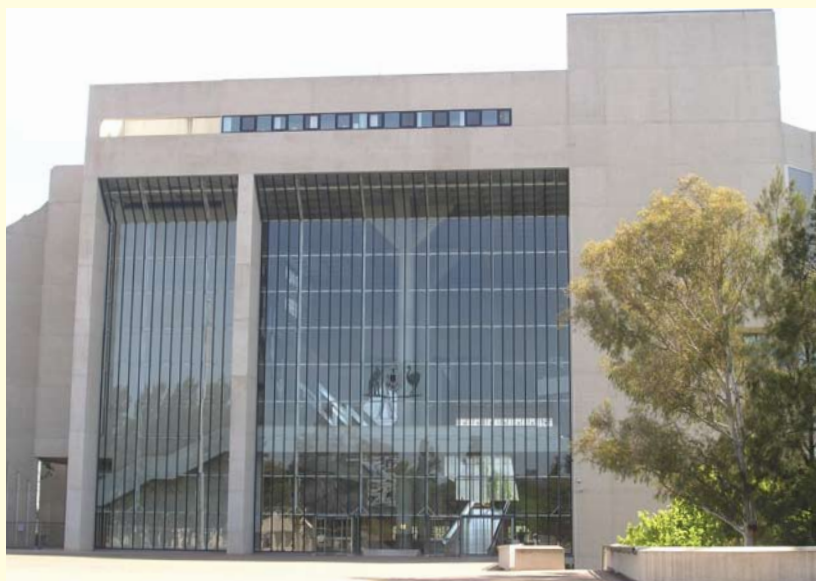
The High Court of Australia, Canberra

The vast collection of the High Court of Australia, held at the National Archives of Australia and by the High Court, includes judges' notebooks, correspondence between members, reports, and records of judgments. It illustrates the development of Australia's common law practices and principles and includes images and film of the opening of the original Court and of the new High Court of Australia building in Canberra. The records provide an insight into landmark judicial decisions affecting Australian society, democracy and government. Issues covered include Commonwealth versus State powers (the Engineers Case of 1920 and the Tasmanian Franklin Dam Case , 1983), economic regulation (the Bank Nationalisation Case , 1948), freedom of speech and subversion (the Communist Party Case , 1951), the separation of powers doctrine (the Boilermakers Case , 1956), Native title (the Mabo Case , 1992), and anti-homosexuality laws and human rights (the Toonen Case , 1994).