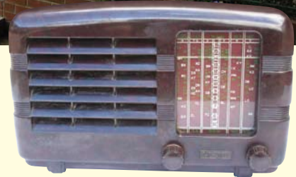
This 'Airzone' wireless radio is kept in situ in the sitting room of the Chifley Home in Bathurst, NSW