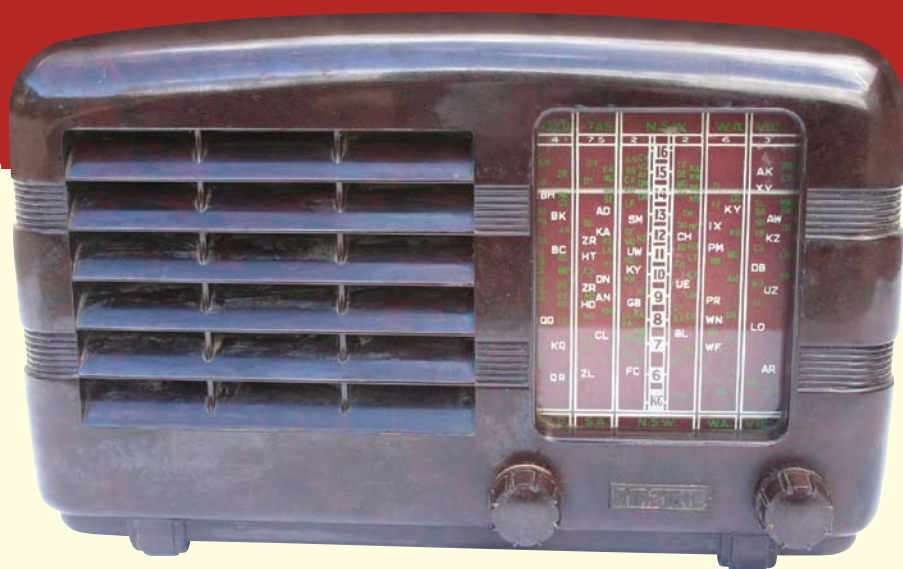
'Airzone' wireless radio belonging to Prime Minister Chifley and his wife is displayed in situ , thereby retaining its full context and meaning.

Following are illustrated examples of 'context in action' across some collection types.