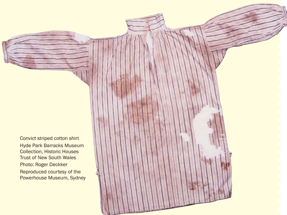
Convict striped cotton shirt Hyde Park Barracks Museum Collection, Historic Houses Trust of New South Wales

While this shirt is seen as a distinctly convict garment, we also know that blue and white striped shirts were issued to assigned servants, and were worn by shepherds, who were often emancipated convicts. The shirts are also widely depicted in images of the goldfields, and were listed in emigrants' guides as standard provisions for the colony. Indeed, this garment counters the popular image of convicts, with their clothes and countenance marked all over with the prominent stamp of convict infamy.