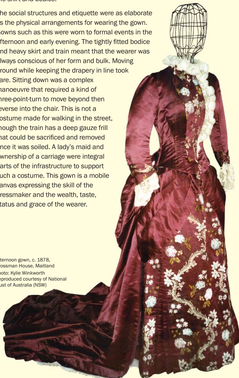
Afternoon gown, c. 1878, Grossman House, Maitland

The social structures and etiquette were as elaborate as the physical arrangements for wearing the gown. Gowns such as this were worn to formal events in the afternoon and early evening. The tightly fitted bodice and heavy skirt and train meant that the wearer was always conscious of her form and bulk. Moving around while keeping the drapery in line took care. Sitting down was a complex manoeuvre that required a kind of three-point-turn to move beyond then reverse into the chair. This is not a costume made for walking in the street, though the train has a deep gauze frill that could be sacrificed and removed once it was soiled. A lady's maid and ownership of a carriage were integral parts of the infrastructure to support such a costume. This gown is a mobile canvas expressing the skill of the dressmaker and the wealth, taste, status and grace of the wearer.